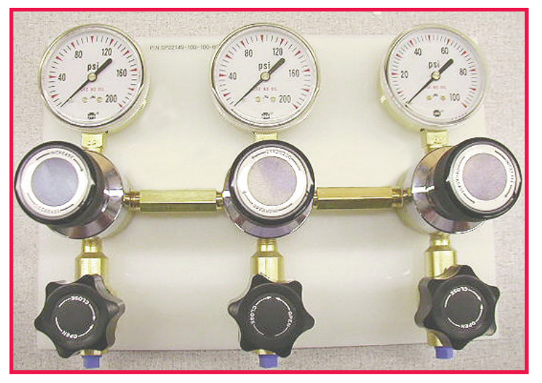
three-regulator panel – inlet may be from the left or the right

2331-H-25-25-50-100-C describes a center inlet brass four-regulator panel in the horizontal orientation, with the first regulator on the left having a 0-25 psig delivery pressure range followed in order by three others: 0-25 psig, 0-50 psig, and 0-100 psig.