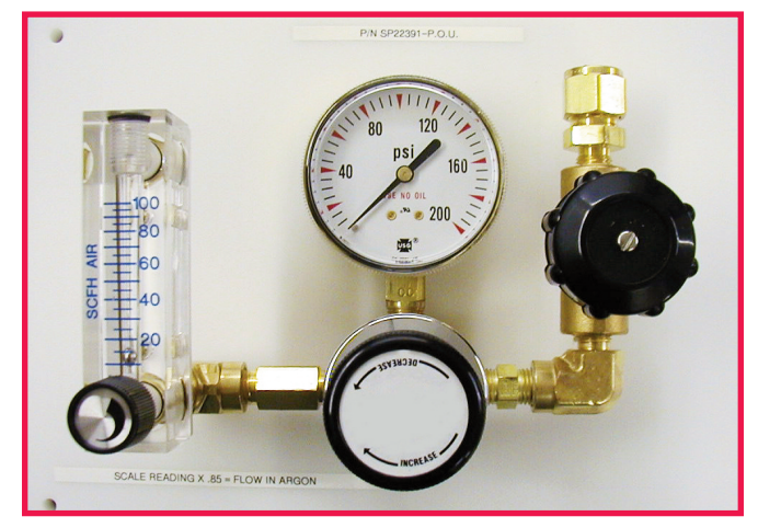
Regulator Flowmeter Panel

Some typical systems are shown on this page.