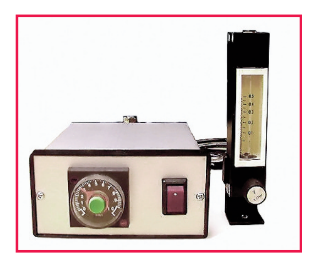
Flowmeter with Timer