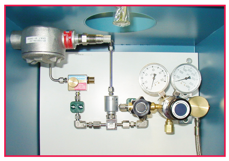
Hydrogen Gas Cabinet with Controls