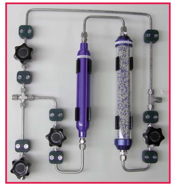
Gas Purifier Panel