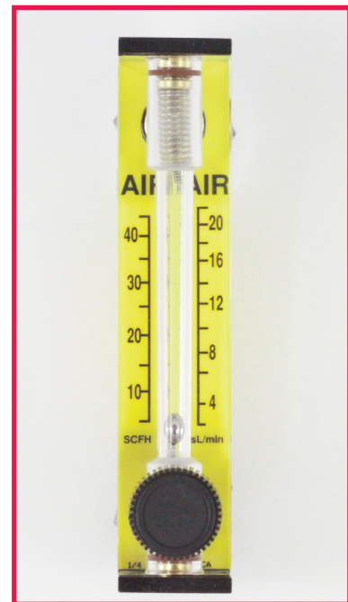
Figure 2 Effect of float position for the same rate of flow in Figure 1, but with increased pressure at the flowmeter outlet.