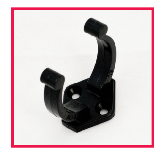
8040C Mounting Clip