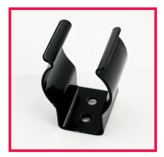
8012C Mounting Clip